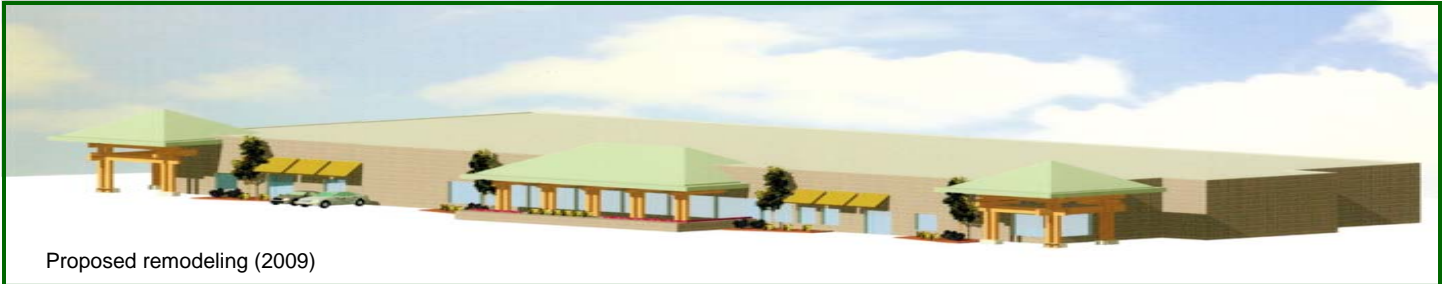
Proposed remodeling (2009)

The Crossings at North Hills N71 W12980 Appleton Avenue Menomonee Falls, WI