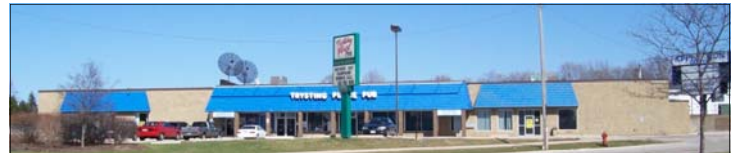
Existing retail center