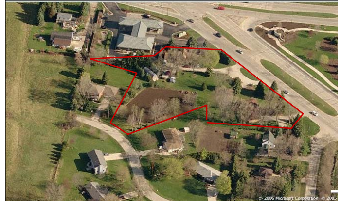
Property boundaries not to scale