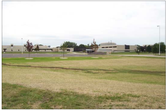
Moraine Park Technical College