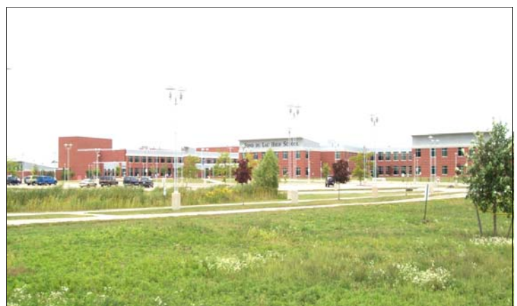
Fond du Lac High School