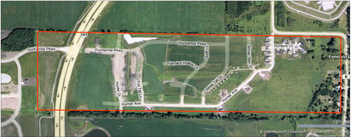
Hwy 151 & Ducharme Pkwy to Hwy K, just north of Hwy 23 (Johnson Road), Fond du Lac, WI