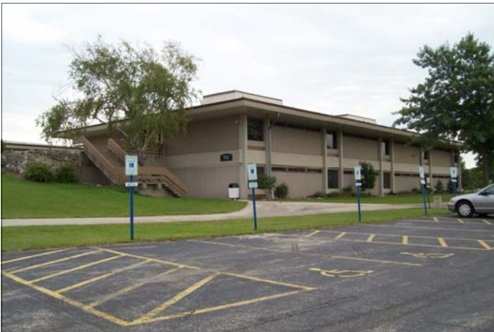
University of Wisconsin Extension - Fond du Lac