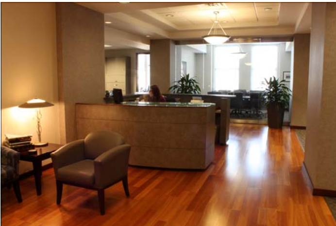
Suites from 950 SF to 9,500 SF