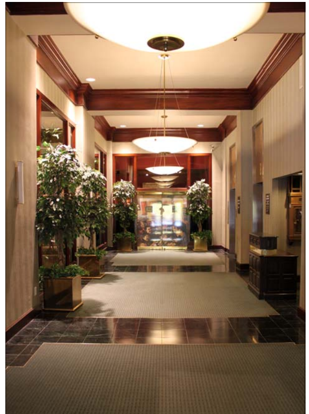
Luxurious lobby & common areas