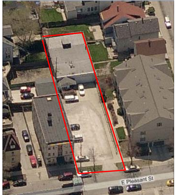
Boundaries approximate and not to scale

LIST PRICE: $400,000 $350,000 - Reduced!