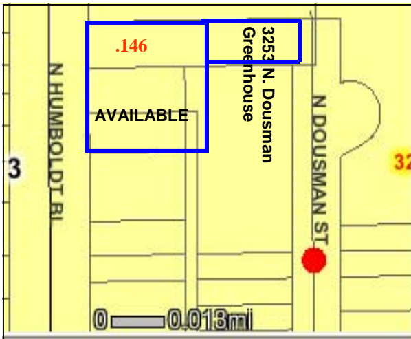
Boundaries approximate and not to scale.