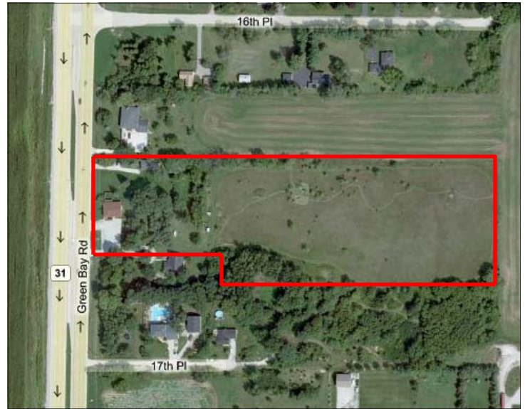
Boundaries approximate and not to scale