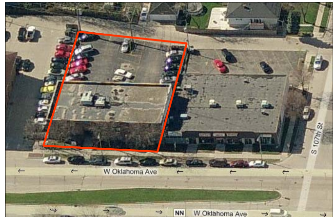
Boundaries approximate and not to scale